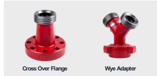
Cross Over Flange